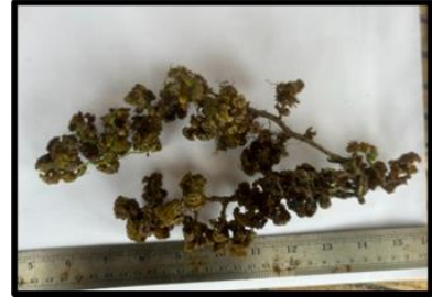
Figure 4. Sargassum cristaefolium