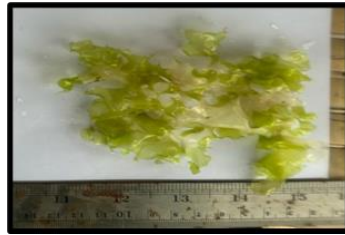
Figure 9. Ulva