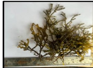
Figure 12. Gracilaria salicornia