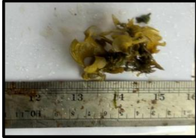
Figure 2. Padina sp

The following are seaweed on Muluk beach, Sengkol village, Pujut sub-district, Central Lombok regency.