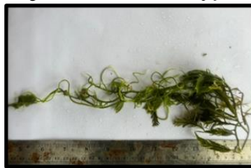
Figure 6. Caulerpa taxifolia