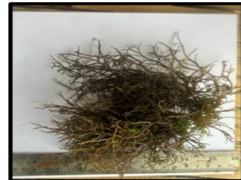
Figure 13. Gracilaria verrucosa