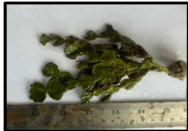
Figure 11. Halimeda tuna