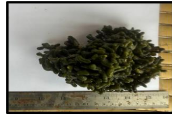
Figure 10. Codium