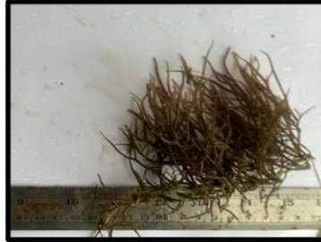
Figure 3. Gracilaria coronopifolia