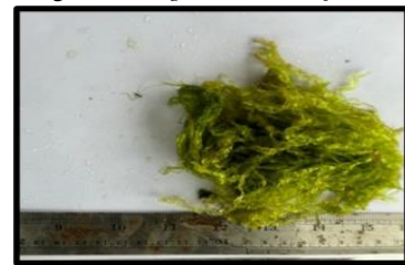
Figure 7. Ulva intestinalis