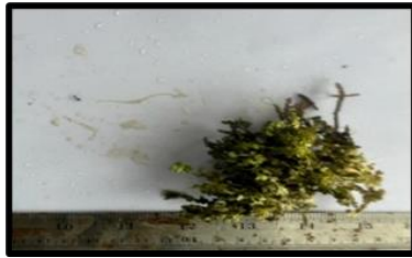
Figure 8. Halimeda opuntia