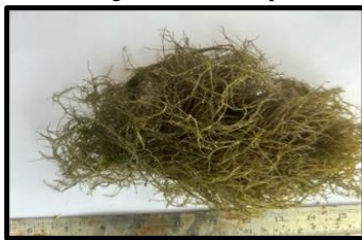
Figure 5. Gracilaria sp