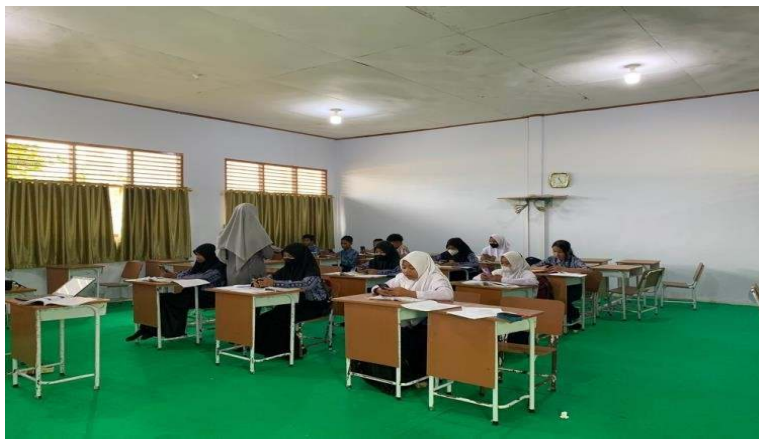
Figure 3. Students using mobile learning applications.

The results of hypothesis testing using the independent sample t-test with the SPSS program obtained a significance value for interest in learning, namely p = 0.000 ( p < 0.05 ) shown in Table 2. This result shows that H_0 was rejected, so that the final interest in learning questionnaire data obtained gave significant differences. There is significant interest in student learning between classes that apply mobile learning-based learning media and classes that apply conventional learning in material classification and changes at SMP Negeri 4 Ukui class VII.