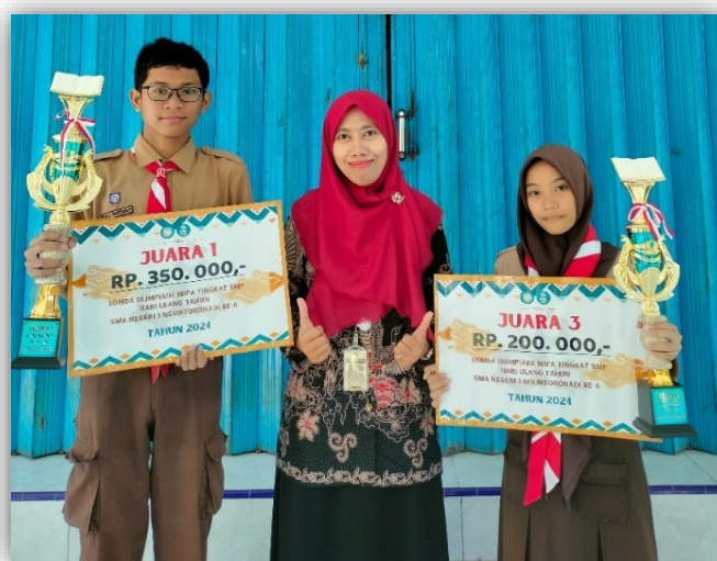
Figure 2. Academic Achievement at the District Level

Appreciation from parents for their children's achievements is also a crucial factor in boosting their confidence. Students mentioned that parental encouragement and recognition of their efforts make them feel more confident in participating in various activities. When parents show pride in their children's efforts, whether in academic or non-academic fields, students feel more motivated to keep practicing and improving themselves. Parental contribution to supporting children's interests and talents not only impacts the individual development of students but also enhances the school's image. The Principal noted that when students achieve success in various competitions, whether at the district or national level, it also increases parents' and the community's pride in the school. Moreover, parents often promote their children's achievements through social media, it is shown in the Figure 2 which is indirectly boosting SMP Negeri 1 Tirtomoyo's appeal to prospective new students.