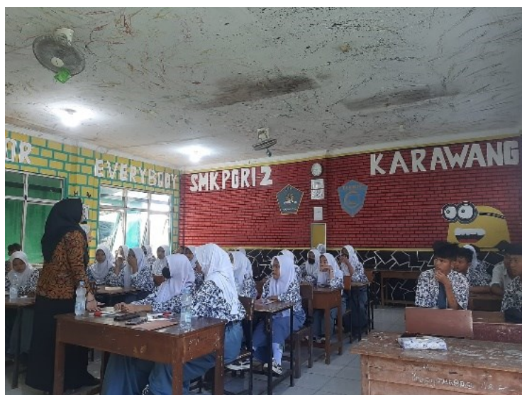
Figure 3. Teacher Started the Lesson and Displayed the Questions on the Projector Screen

The teacher opened the lesson by praying and taking attendance of students. The teacher distributed paper, which is a barcode of multiple-choice answers, then the teacher gives instructions to students on how to use Quizizz paper-mode.