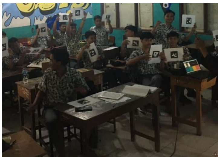
Figure 2. Teacher Opened the Lesson by Praying and Taking Attendance of Students

The teacher installed the projector and laptop before the start of the teaching and learning activities. Then, the teacher logs in to the Quizizz application and opens the questions that have been created. The teacher then connected the Quizizz application to the smartphone, which is used to scan the students' answers.